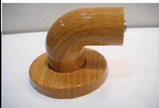
Traditional Wood Pattern 傳統木紋