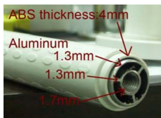
Section detail (white)