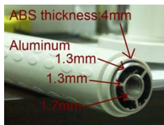
34mm tube diameter